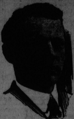
CHARLES E. MERRIAM, Republican.