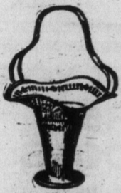
Handsome Flower Basket, $9.65

What an hour it is to be sure—that when tea is to be served. Ceremonial in the Old Country and almost so here. The pleased expectant faces of the guests, the warm soft light of shaded lamps and the flicker of firelight on the heavy silver tea-set. How the countenance of the happy hostess lights as she betrays natural pride in her tea service. And in breaks of the conversation, the visitors cast admiring glances at the receptacles where the herb is bubbling so briskly.