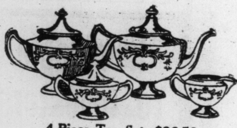
4-Piece Tea Set, $26.50

Illustrated—Teapot, Coffee Pot, Sugar Bowl and Cream Jug, in bright silver plate, with beautifully engraved decoration. Silverware Sale, $26.50.