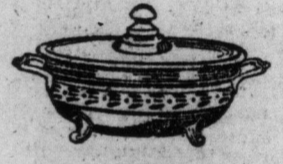
Pyrex Casseroles, $10.79

Illustrated—pierced silver-plated stand with genuine fireproof lining and cover fitted. Silverware Sale... 10.79