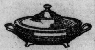
Attractive Bake Dish, $8.29

Illustrated—pierced silver-plated stand with genuine fireproof lining and cover fitted. Silverware Sale... 10.79