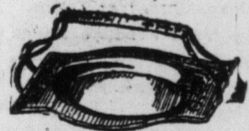
Roll or Bread Tray

Illustrated. Biscuit Jar, with glass body and silver-plated cover in brilliant finish. Silverware Sale... 2.55