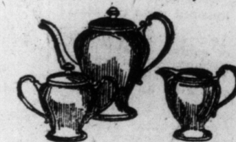
3-Piece Tea Set, $15.48

Illustrated—including large Teapot, Sugar Bowl and Cream Jug in silver-plated plain design with bright finish.