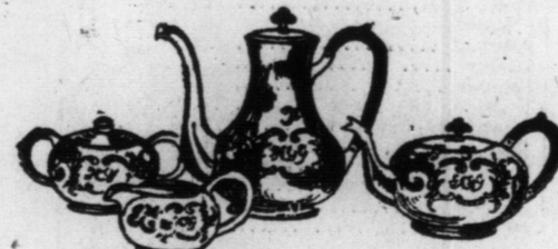
4-Piece Tea Set, $60.25

Illustrated—heavily silver-plated, in massive plain design with rich hand-engraved scroll decoration. Including tea and coffee pots with ebony handles, sugar bowl with cover, and cream jug, gold lined. Silverware Sale, $60.25