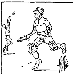
And patent rollers for base sliding.

gallop their hobby-horses up and down. Those that ain't got any horses jist put in their time trying to lame other folkses. It's pretty mean work, but it's all some of 'em do to earn their salaries, an' I sometimes think it would be wrong to keep 'em from doing something, no matter what they're at.