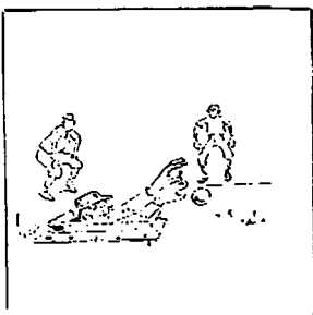
A hole for the short-stop.