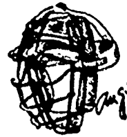
Nerlich & Co.

and the firm have found it necessary to have two men visit the trade with one set of samples. The eastern representatives will also cover western Ontario, so that the usual visit to the trade may be somewhat later than usual. Many a customer will be more than repaid for the delay on inspecting the immense line shown.