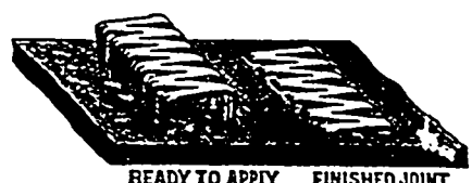
READY TO APPLY FINISHED JOINT