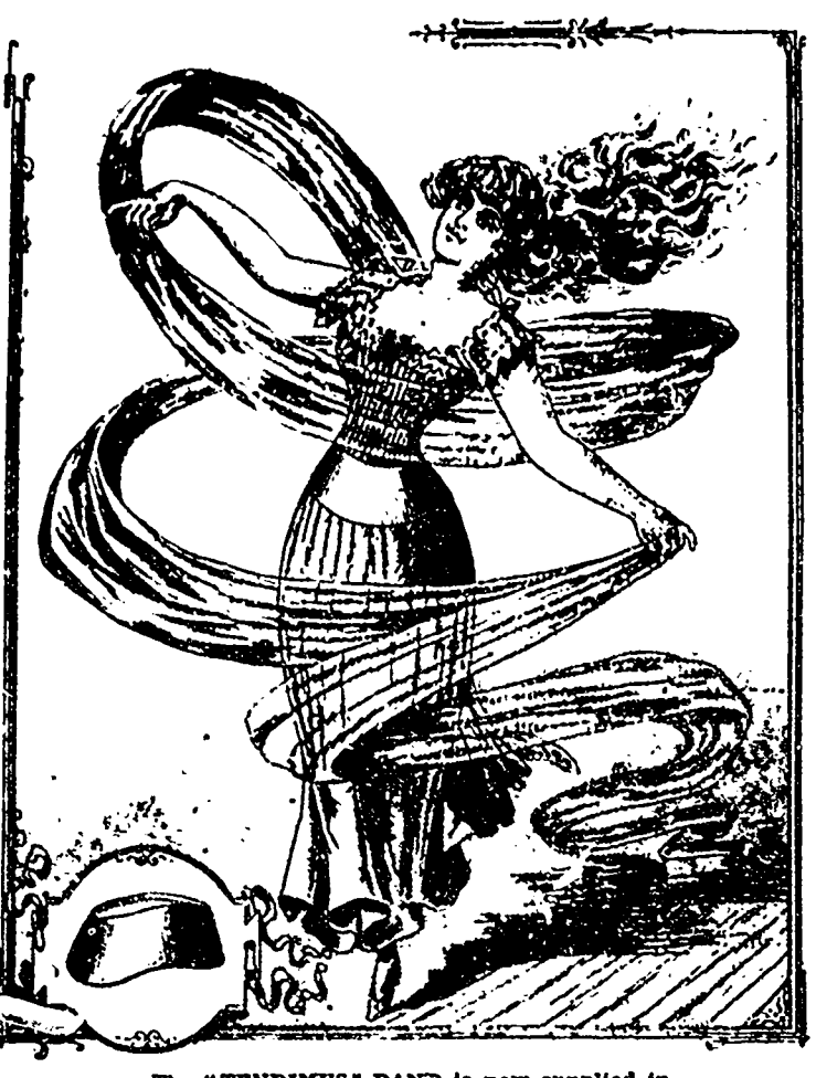
The "TENDIMUS" BAND is now supplied in