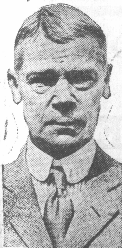
Cyrus E. Woods

American Ambassador to Japan, who is directing the relief measures of the United States Government following the recent earthquake in the Island Kingdom.