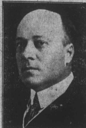
Well known banker who has been elected Vice-President and General-Manager of the Industrial Finance Corporation at the annual meeting of the Board of Directors in New York. He was formerly Vice-President of the National City Bank of New York, and is widely known in Canadian Banking circles.