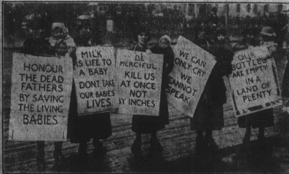
A deputation of mothers with their babies and placards, photographed near the entrance to the Parliament Buildings, in London. They called at the House, recently, to advocate cheap issues of milk for babies of unemployed.