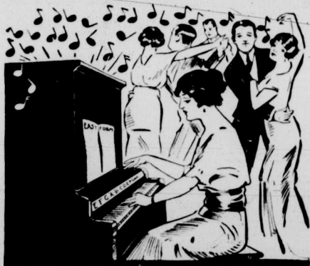
"Just Think! I Never Touched a Piano Before."

We send the entire invention absolutely free. It will enable you to read and play at once—within one hour any one of the 100 pieces of music we send you which music is among the world's best pieces written by famous composers. No charge of any kind. No come backs or tricks.