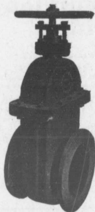
Flanged End Gate Valve with Hand-Wheel.