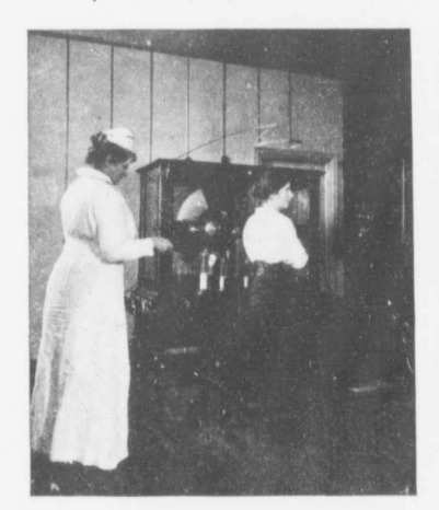
A Static Breeze

Electro-therapy is amply provided for, as is shown by the accompanying illustrations.