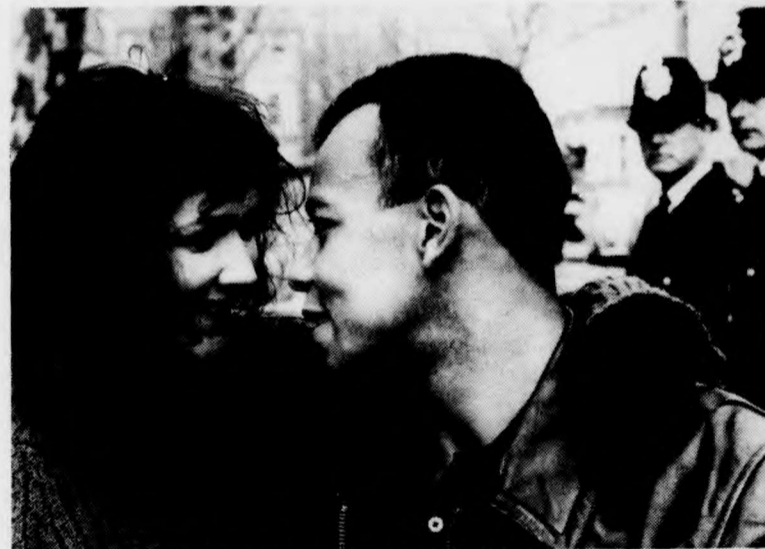
ARE THOSE COLOURED CONTACTS OR ARE YOUR EYES REALLY PHOSPHORESCENT? Sammy (Shashi Kapoor) and Rosie (Claire Bloom) in Stephen Frears' latest film, Sammy and Rosie .