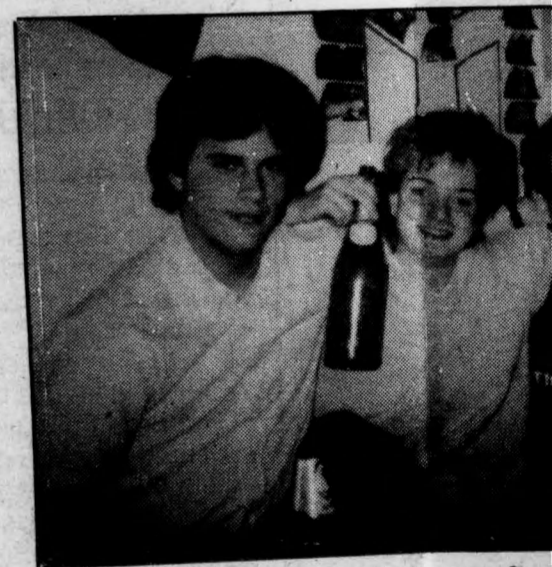
"And good times were had"