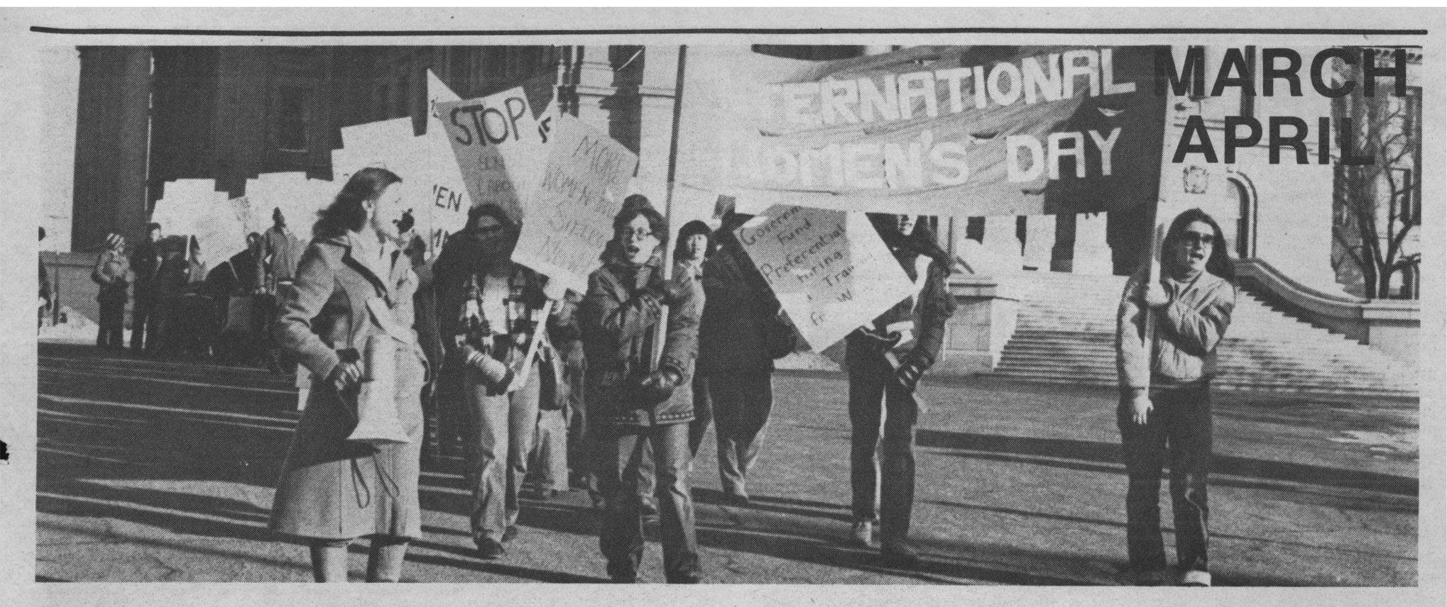
March started, as usual, with a protest march. This time the festivities involved a number of irate women, armed with sound guns and sticks. by Karl Wilberg