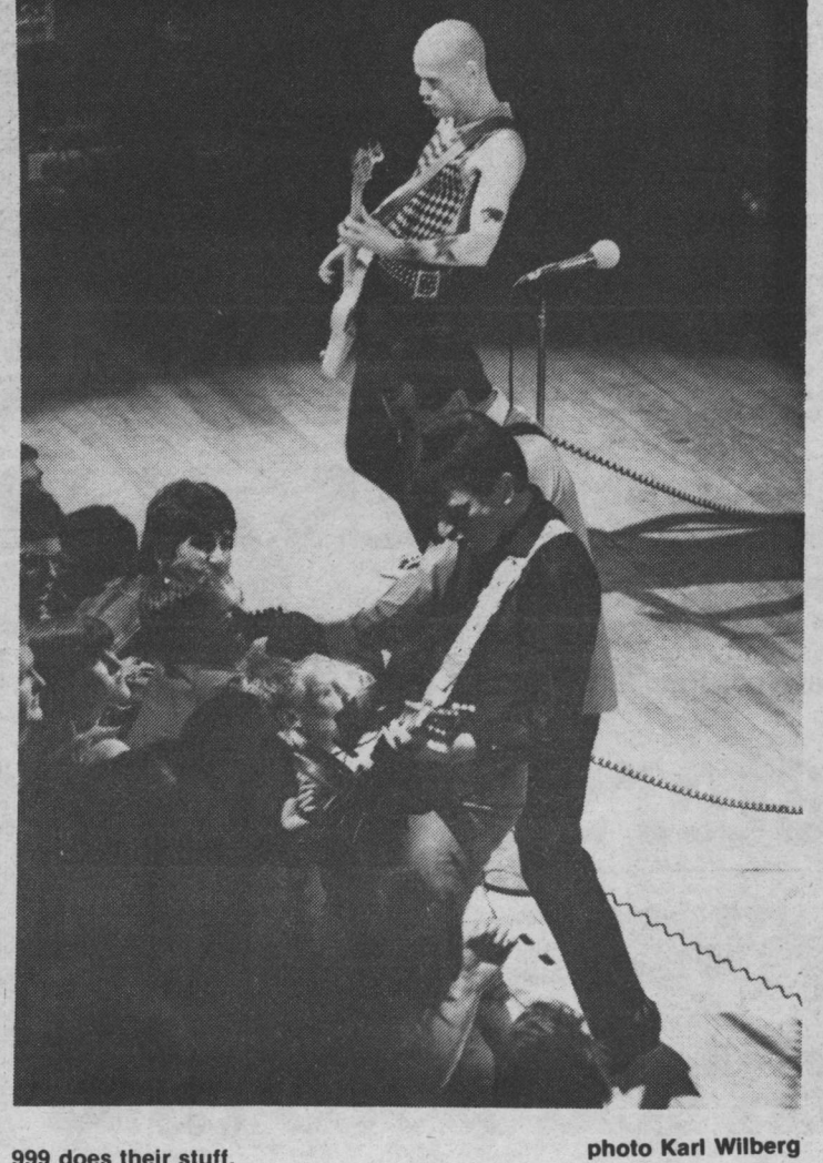
999 does their stuff.

Good news for students just didn't seem to be in the works in March. A Gateway leak revealed that rent increases of up to 30 per cent were being proposed for university housing units. At the same time, the university released a survey outlining students' complaints about housing, especially in Lister Hall. As part of the proposed increases, though, the Lister residents would be charged more for chow and be nailed with 10 per cent hikes in room rents. At