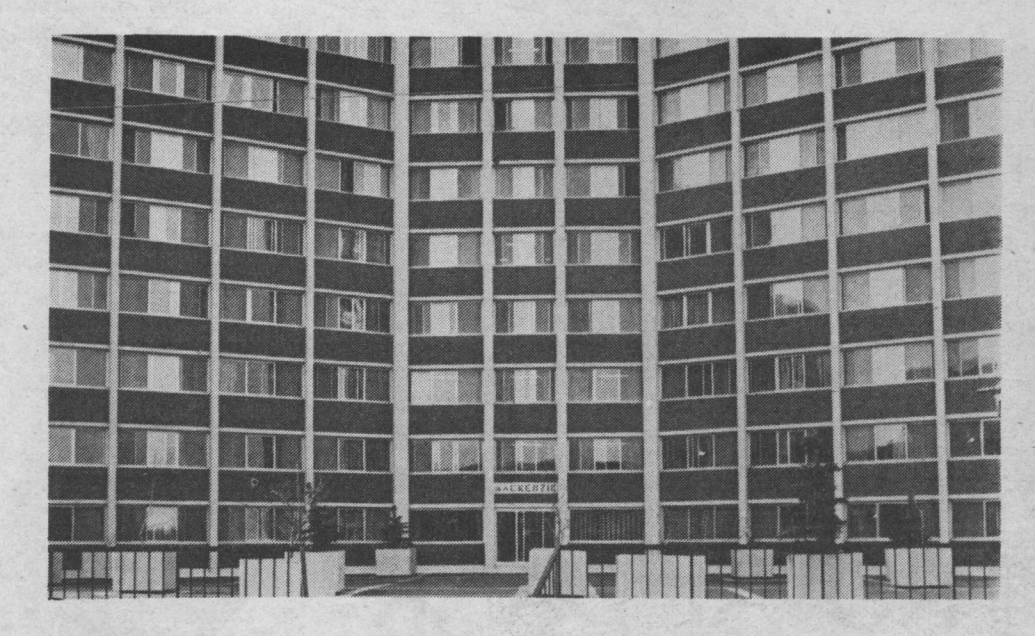
Since when do bees have rent raised for the beehive?