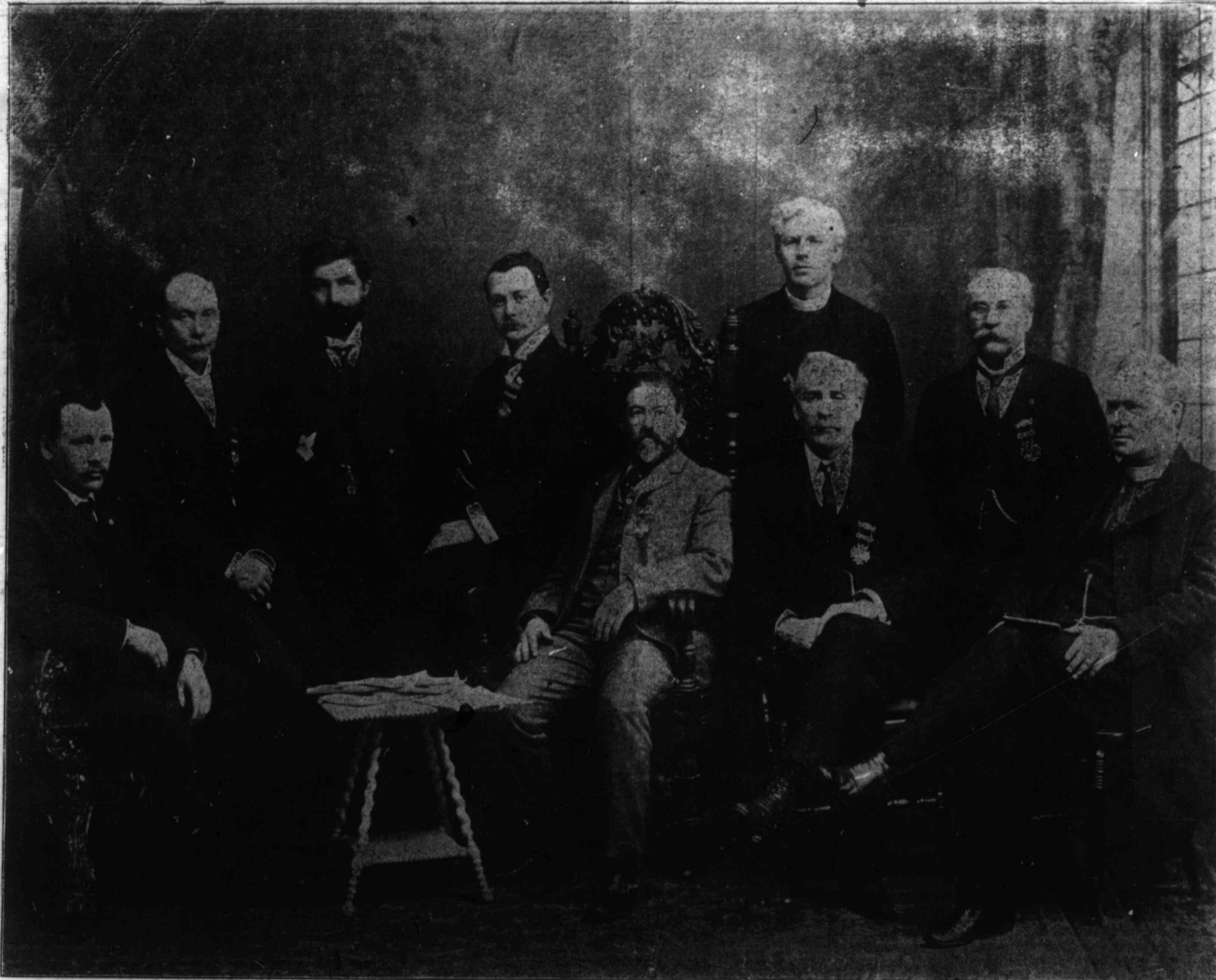
ONTARIO PROVINCIAL COURT OFFICERS, CATHOLIC ORDER OF FORESTERS 1902-1903