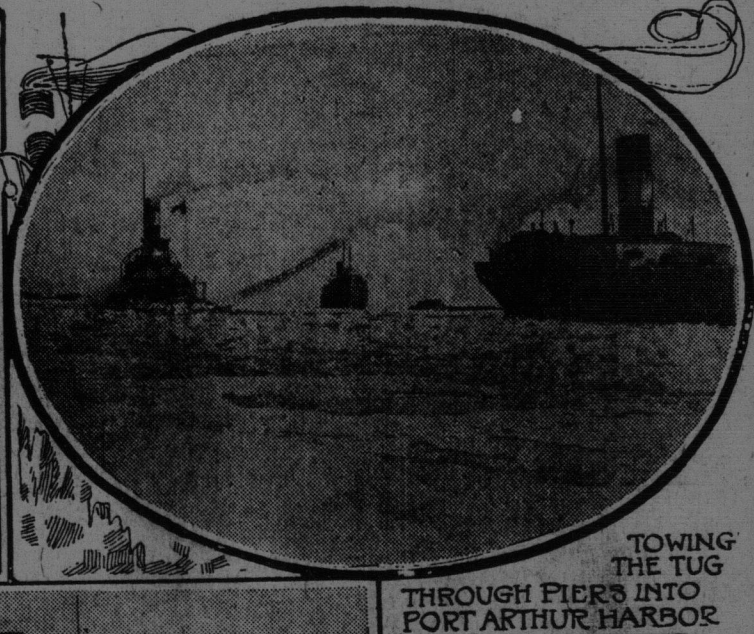
TUG TOWING THE TUG THROUGH PIER INTO PORT ARTHUR HARBOR TO BE LOADED