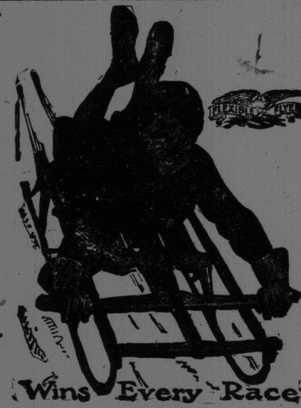
Wins Every Race

W. H. THORNE & CO., LTD. Stores Open at 8.30 a.m. OPEN EVERY EVENING TILL 10 O'CLOCK, up to and including Christmas Eve.