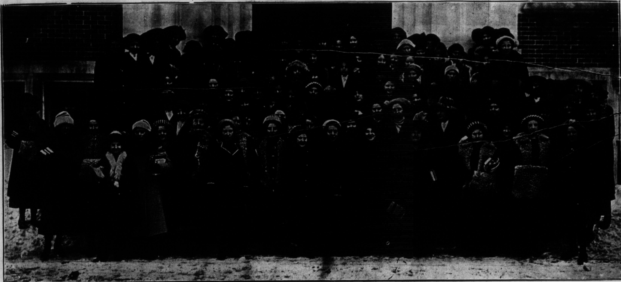
GIRL STUDENTS BRANTFORD COLLEGIATE INSTITUTE.