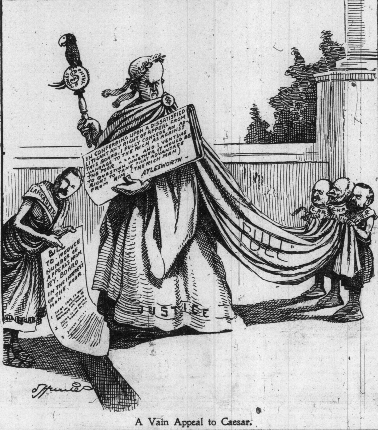
A Vain Appeal to Caesar.