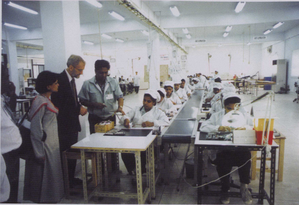
Export processing zone-Chittagong