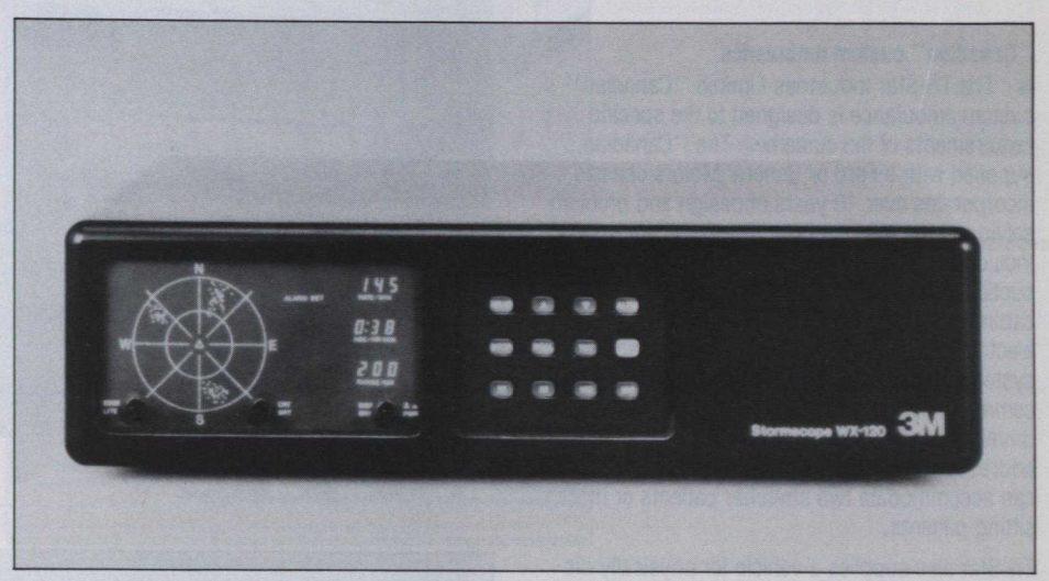
The 3M "Stormscope" WX-120

3M Canada Inc. has production facilities in London, Perth and Toronto, Ontario, and in Morden, Manitoba. The company conducts ongoing research in many areas. It has a large volume of foreign business, especially to 3M subsidiaries.