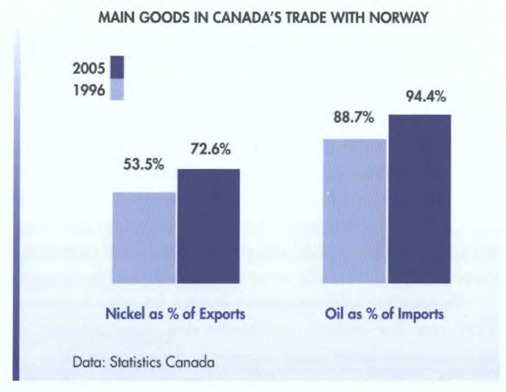
Provided by Foreign Affairs and International Trade Canada's Office of the Chief Economist, www.international.gc.ca/eet.

Canada's trade with the Nordic countries has been growing, in large part due to trade with Norway. Over the past ten years, Canada's exports to Norway increased to $1.6 billion, up from $848 million in 1996; imports from Norway have doubled, reaching $6.1 billion in 2005. Norway represented 54.1% of imports from, and 54.5% of exports to, the Nordic countries in 2005. While opportunities abound in S&T, investment and other trade areas, trade with Norway is dominated by two commodities: 94.4% of Canada's Norwegian imports are of oil, and 72.6% of Canada's exports to Norway are of nickel. The nickel exported is almost entirely nickel matte, which is sent to Norway for refining. Trade with the rest of the Nordic countries is more diverse, with vehicles, machinery and electrical machinery featuring as prominent exports, and imports topped by energy, machinery and pharmaceutical products.