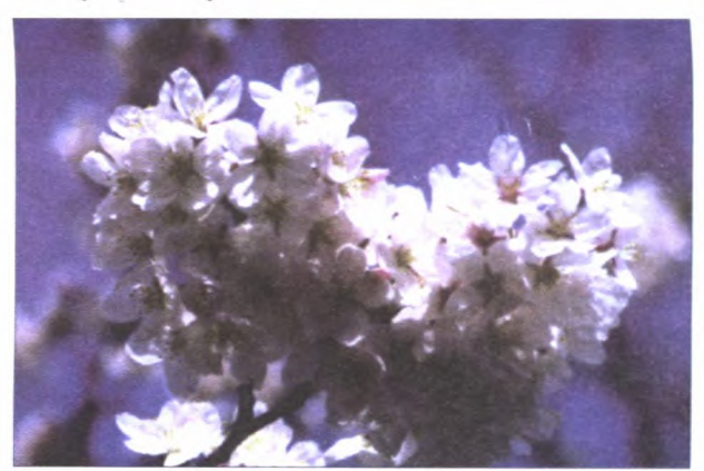
Japan's famed cherry blossoms

One of the most effective ways to work toward sustainable cities is by developing partnerships between city authorities and the private sector. Business leaders, academics and local community associations, allied with