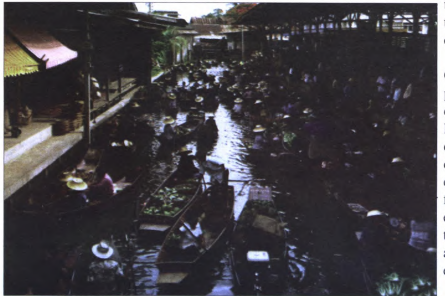
Floating Market, Thailand.

local authorities, can find creative solutions