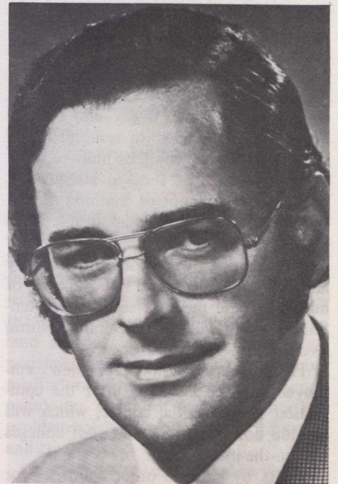
Solicitor-General Francis Fox

Embodied in the principles of the Minister's response is the recognition of the role of the staff in the reform of penitentiaries. "In reaching the goal of a professional career service, the RCMP model is one which will be given consideration," he said. "The Minister strong-