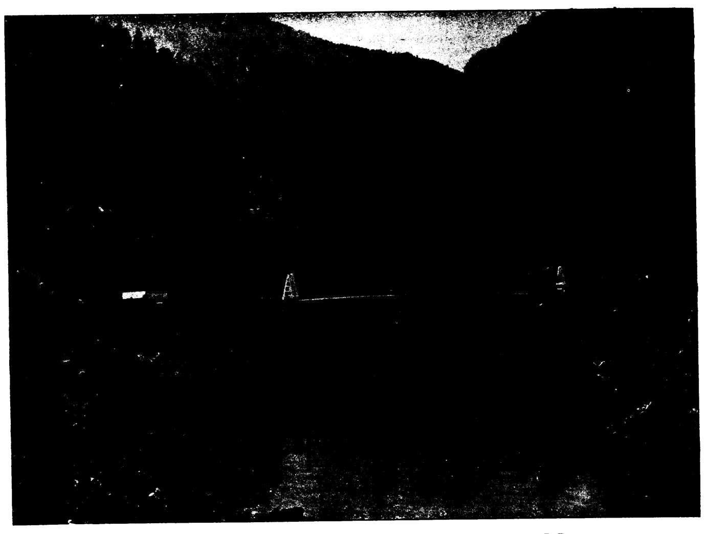
SUSPENSION BRIDGE, NEAR SPUZZUM, FRASER RIVER, B.C.