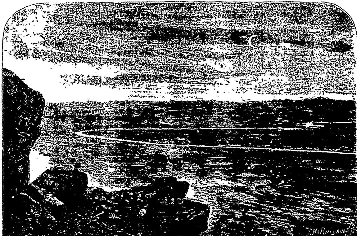
VIEW OF THE NILE FROM MOUNT FOGO.