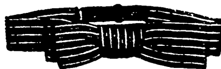
NIAGARA NECKWEAR CO.

Character, style and finish are the virtues possessed in these few styles of bows, the production of the Niagara Neckwear Co., Ltd., (D. S. Co.) They make an unlimited variety of styles, but these are leaders to retail at 25c.; attachments the best that do not pull off, and extra length bands. Bows no doubt will be very popular this season.