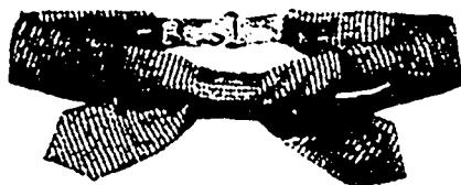
NIAGARA NECKWEAR CO.

A NOVELTY just now is a Madder Derby scarf, an excellent imitation of the silk Madder which retails at 50 and 75c. The new line seen at W. R. Brock & Co.'s can retail at 15c. Other noteworthy lines at this house include men's white duck waistcoats, single and double breasted, also fancy checks and stripes in cream, navy and fawn effects of duck and cashmere; bathing suits and trunks to retail from 5c. to $1 per garment.