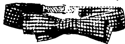
NIAGARA NECKWEAR CO.

In men's and boys' sweaters popular colors are white, black, navy, cardinal, dark tan and heather. Bicycle hose, to match these, are shown by Wyld, Grasett & Darling, the favorite patterns being large broken checks.