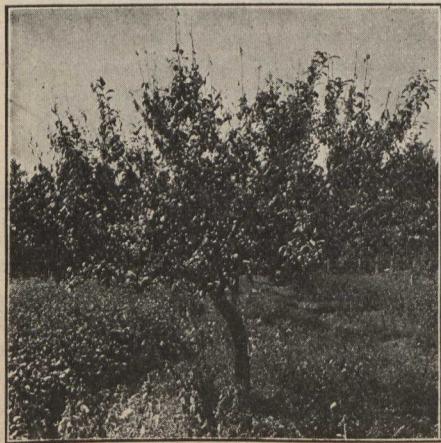
Apple tree badly attacked by "Fire blight" through blossom inoculation in spring and twig inoculation by aphids. Eighty per cent. of twigs and small branches killed out in one season.

Insects, more than any other thing, are responsible for spreading the blight. It was demonstrated a few years ago that bees, wasps and other blossom visiting insects often carry the germs of the disease on their bodies, especially their mouth parts, to the blossoms they visit in the orchard. When they insert their