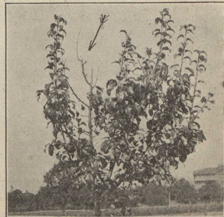
Young pear tree, with one branch inoculated with the germs by the pruning saw. The branch was killed and the disease was spreading from this branch to the others.