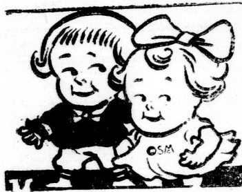
Their Sunday Picture