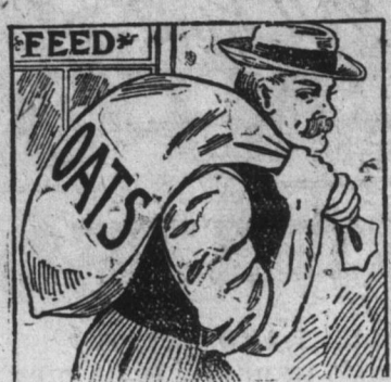
To-day ex. "DIGBY" from Halifax: