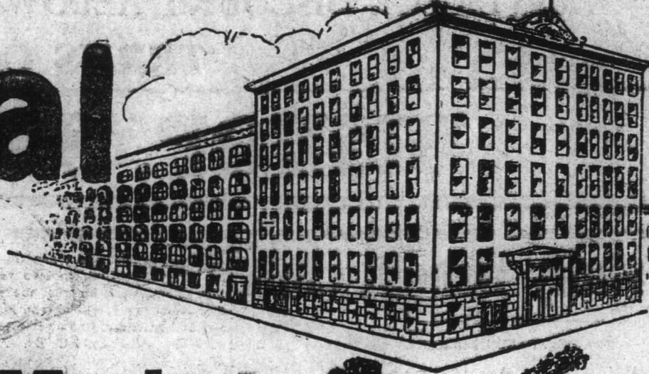
Head Office and Chief Warehouse Canadian Fur Auction Sales Co. Limited

With Champlain came the first fur traders on this continent! Away back in 1608, when sent out from France by the great Company of Merchants, they established the first fur trading posts in Canada.