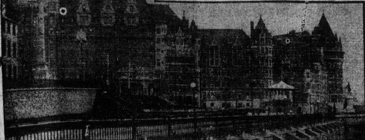
(1) Chateau Frontenac, Quebec. (2) Toboggan Slide, Citadel Hill, Quebec.