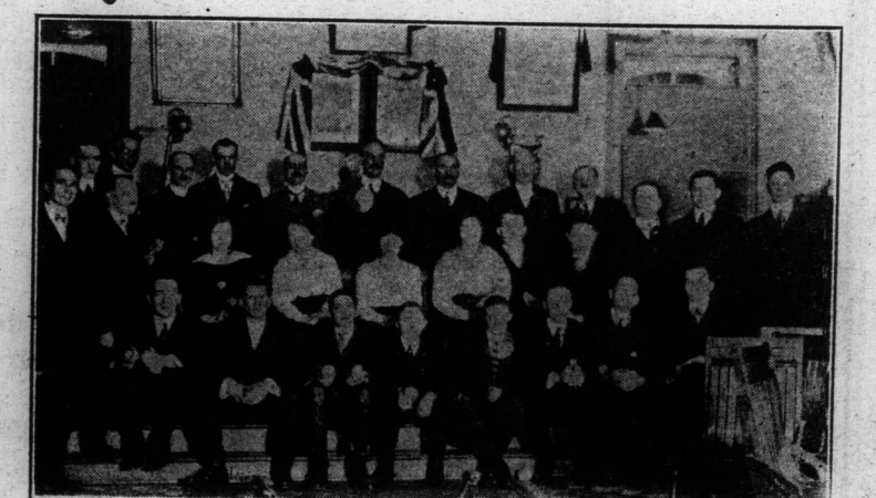
The staff and the directors of The Courier, photographed together on the occasion of the Get-Together Banquet on Wednesday night. How many of them do you know?