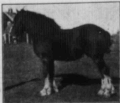
"Enterprising," 18909; sire, "Boquan Victor," by "Apukwa," 18903; dam, "Mary of Inch," 24088, by "Hiawatha"; First and Reserve Champion Stallion, Edmonton Spring Show, 1917, and First in Class at Calgary. Head of my Stud.