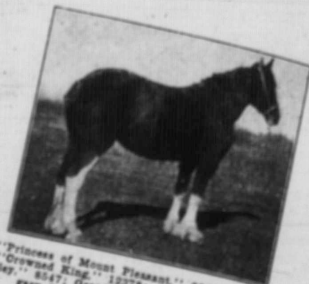
"Princess of Mount Pleasant," 35435; sire, "Crowned King," 12378; dam, "Lady Garry," 8547; Grand Champion Female at Calgary Spring and Summer Fairs, 1918.

For productiveness, utility, durability, constitution and kindly disposition, the Clydesdale has no equal.