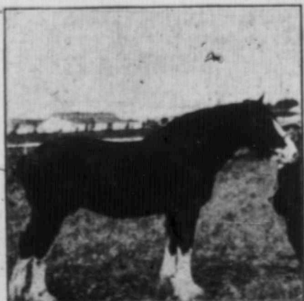
"Scotland's Seal," 19679; sire, "Scotland's Victor," 19729; dam, "Princess of Weston," 26847. Grand champion at Calgary Summer Show, 1918. Now at head of my own stud at High River, Alta.

I have imported more Champion Clydesdale Stallions into Western Canada than any other individual or firm in recent years, and their records and that of their get in the show ring and at stud prove they have made good.