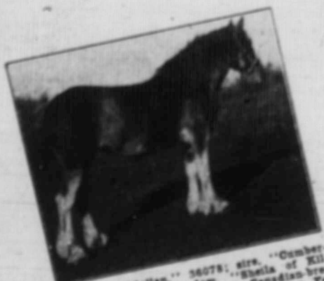
"Boss of Kilallan," 36078; sire, "Cumberland Seal," 14789; dam, "Sheila of Kilallan," 28274; First in class, Canadian-bred Champion and Reserve Open Champion Female, Edmonton Spring Show, 1918.

Heredity presents no picture so clear cut as the modern Clydesdale descendant from the parent Scotch stock