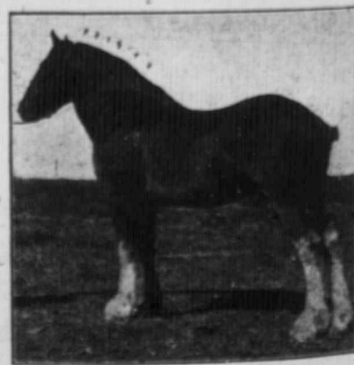
"Scotland's Regent" (Imp.), 17278, by "Baron Watha," 12669, by "Hiawatha"; Dam by "Sir Everest." Champion at Calgary Spring Horse Show, 1916. Now at head of stud of The Douglas Lake Cattle Co., Kamloops, B.C.

In the tiful" of Du 4-year "May "Edit 39255. (Imp.) I have All of the and ot