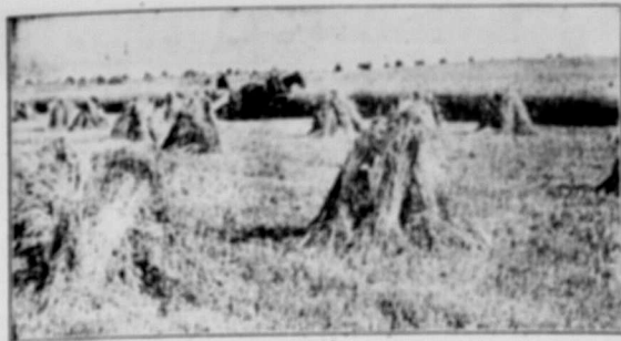
Cutting Brown Grass for seed and hay in Western Canada

BROME GRASS ( Bromus Inermis )—The surest grass for all conditions of the West, moist or dry, light or heavy soil, rock or peat, yielding heavy crops for hay, (mowing early and late pastures), and filling the land with root growth an essential especially on light or long worked soils, for succeeding grain crops. It has a fault—being somewhat hard to get out of the ground when firmly established. This, however, can be overcome by ordinary pasture methods. Our stock is chosen, being grown in Saskatchewan by most reliable barstons. Now 14 to 16 lbs. per acre. Price for best seed, $14.00 per 100 lbs. bag included.