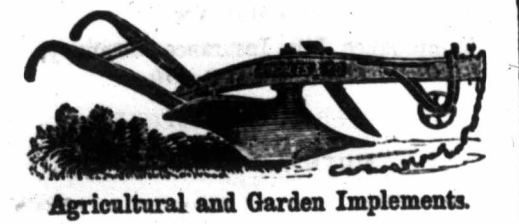
Agricultural and Garden Implements.