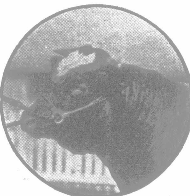
Field Marshall = 100215 =, first senior calf at Toronto and London, 1915.