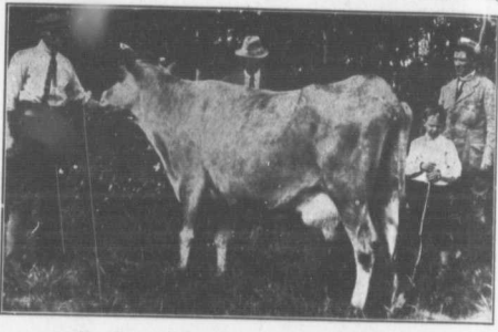
The Greatest Jersey Producer in the British Empire

In the south-western peninsula of the province of Ontario tobacco growing has become a very profitable branch of farming. In order to place the industry on a substantial footing