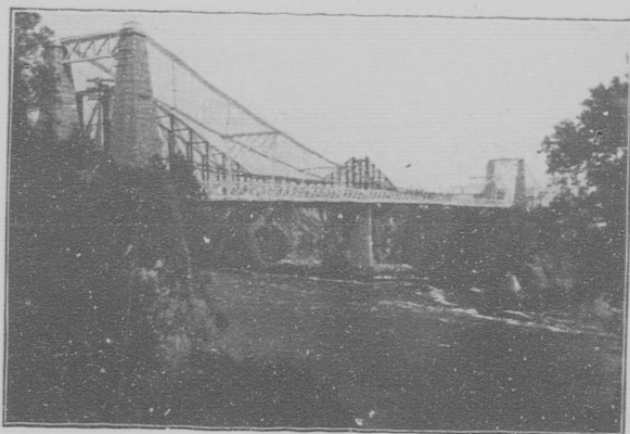
BRIDGES, ST. JOHN.

Therefore, let us be thankful that there are still thousands of cool green nooks beside crystal springs, where the weary soul may hide for a time, away from debts, trains and devillries, and a while commune with nature in her undress.