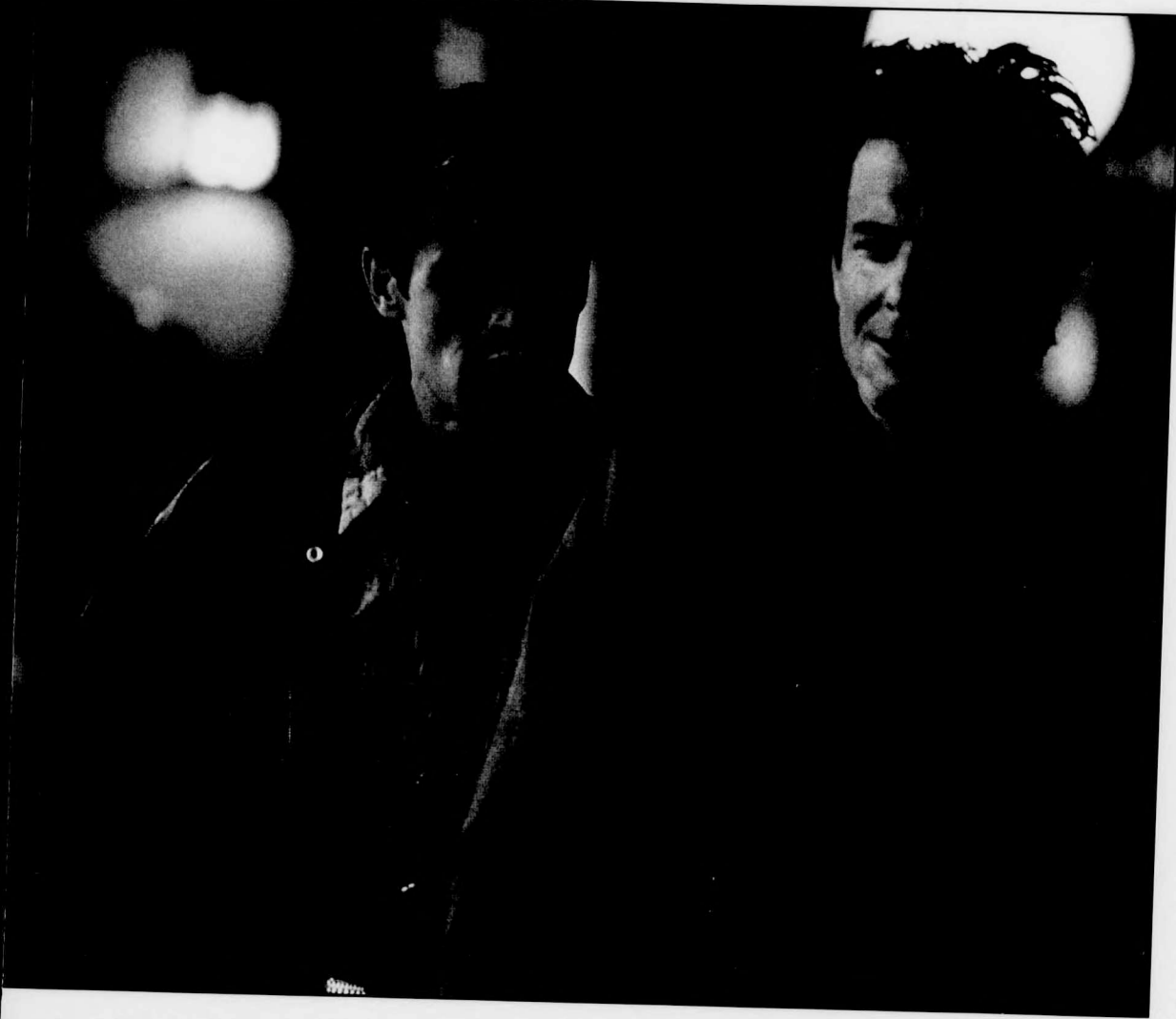
Willem Dafoe (far left) and Mickey Rourke team up for a suspenseful tale set in New Mexico. Below, Dafoe as the cynical Lt. Commander Virgil Cole in the wartime action adventure Flight of the Intruder .

whose shocking discovery of a corpse brings him into contact with the Federal Bureau of Investigation.