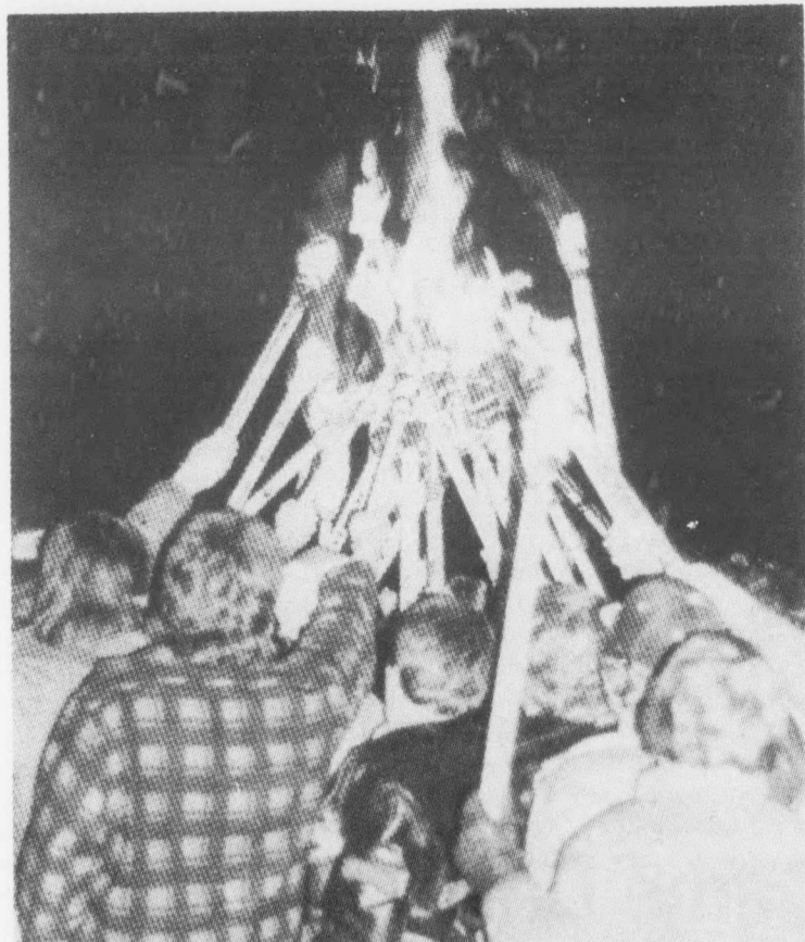
On Wednesday, Varsity Mania will revive an old UNB tradition. Prior to the UNB-STU hockey game on Wednesday, a torch rally will be held in front of the SUB similar to this one in 1983.