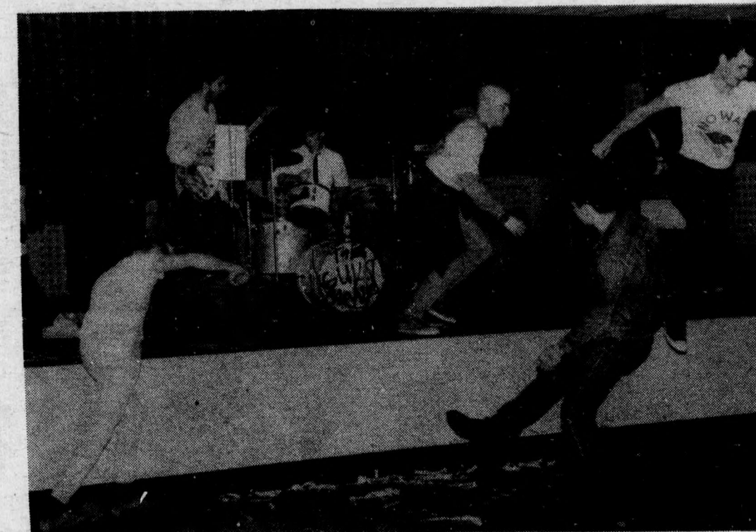
The Guilt Parade and friends

Since the failure of Go Four 3, future dates for live bands to come to Fredericton have been cancelled. However, one hardcore band, S.N.F.U., is scheduled to come to Fredericton on