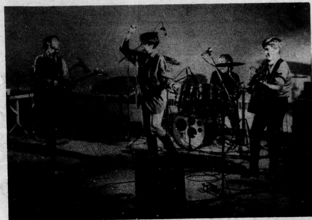
Go Four 3

hard to find "real good, live, original, alternative music, and we are just trying to provide that for people."