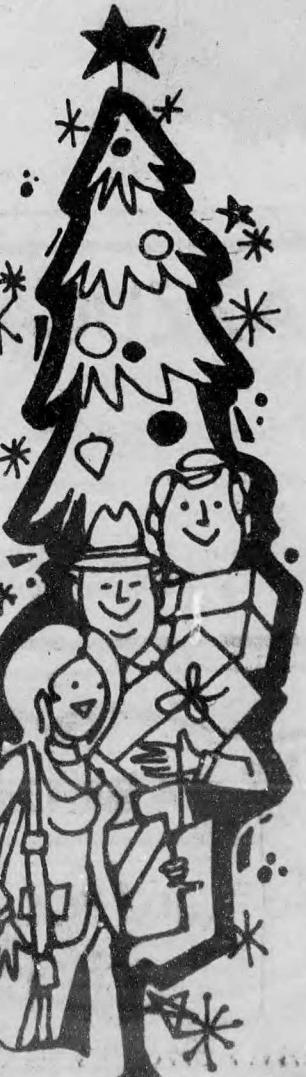
Photo of The Week