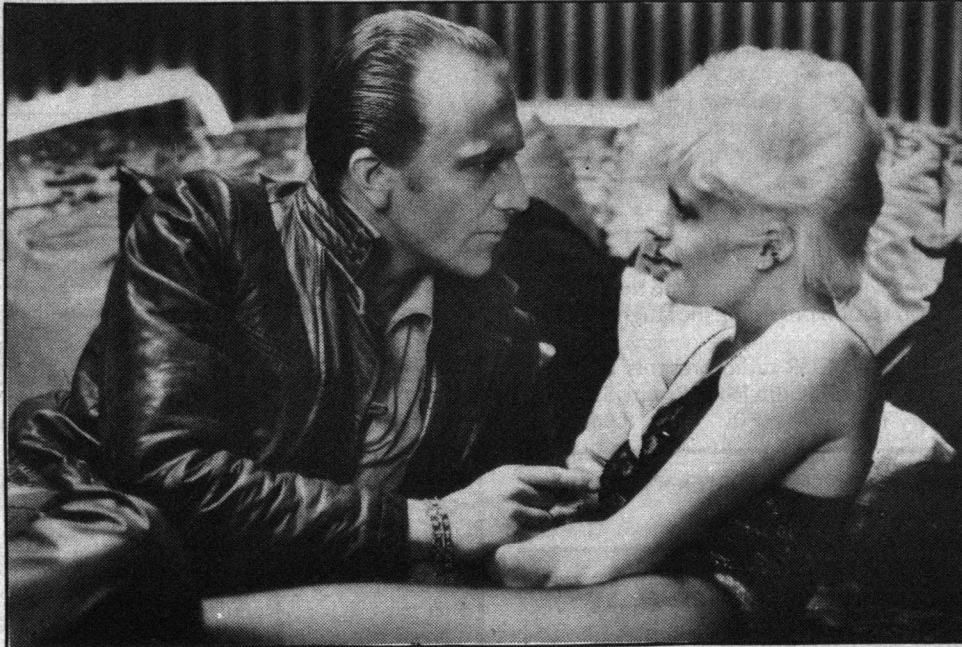
Craig Wasson and Melanie Griffith star in Body Double .

Brian de Palma is well known for his graphic visual effects, and Body Double lives up to expectations. In fact, a lot of knee-jerk activists have complained boisterously of the nudity and violence depicted in this film. If protesters took a little time to evaluate it, though, they would realize that Body Double is a film about pornography and the effects it can have on a relatively healthy, sane individual. The film itself is not pornographic.