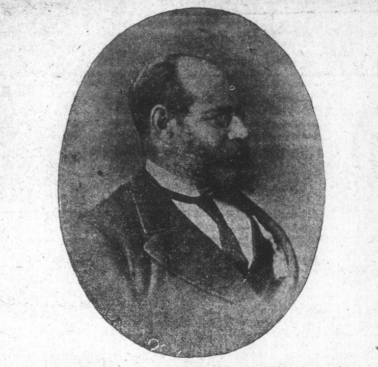
SIR RICHARD CARTWRIGHT, G.C.M.G., P.C. MINISTER OF TRADE AND COMMERCE.

The fire was not discovered until it had gained tremendous headway. Before anybody could ring in the alarm the whole interior of the building was a mass of flames.