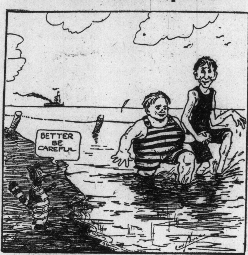
TORONTO WORLD'S PROVERB PICTURE NO. 56