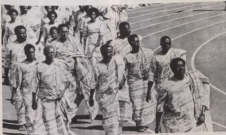
Athletes from Ghana parade in their colourful printed national dress.