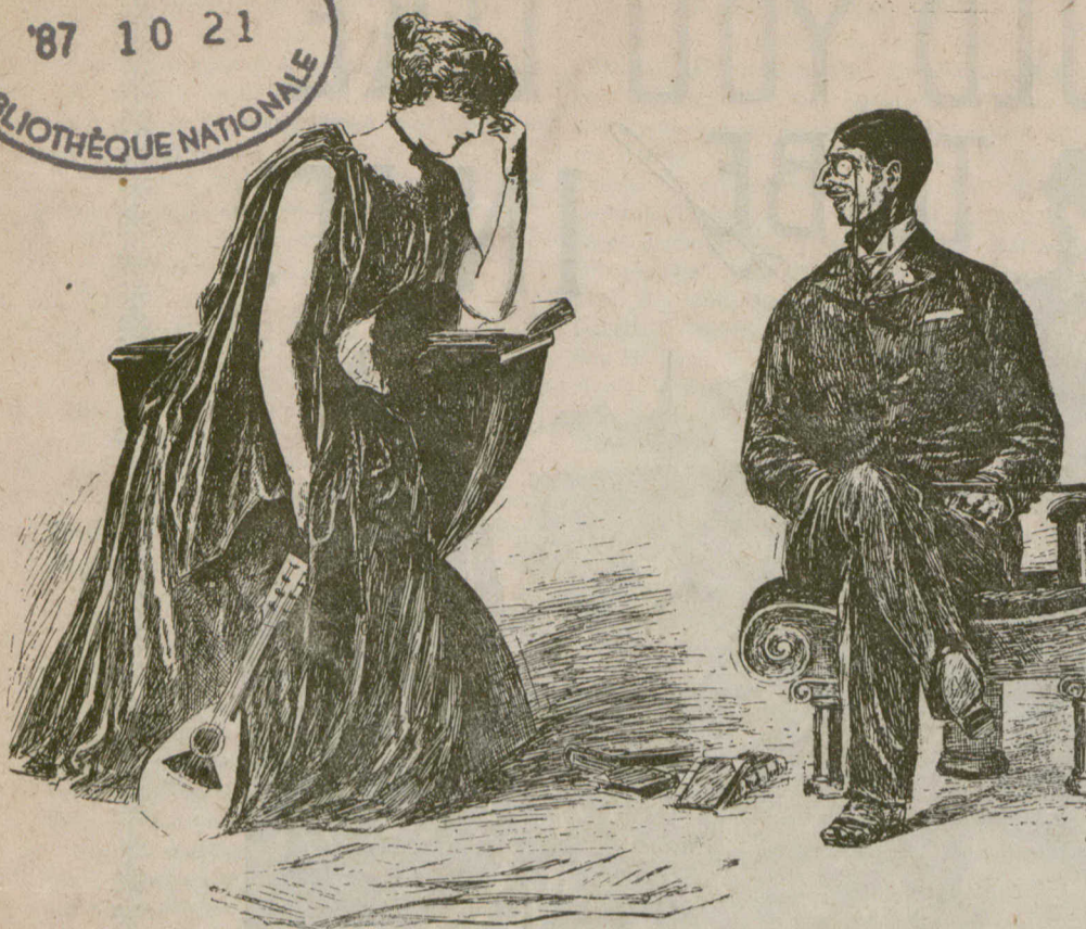
IN THE GREEN-ROOM.

16 NATIONAL LIBRARY '87 10 21 BIBLIOTHÈQUE NATIONALE