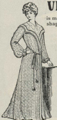
Ladies' Dressing Gown.

GUARANTEED AGAINST SPOILING BY SHRINKAGE