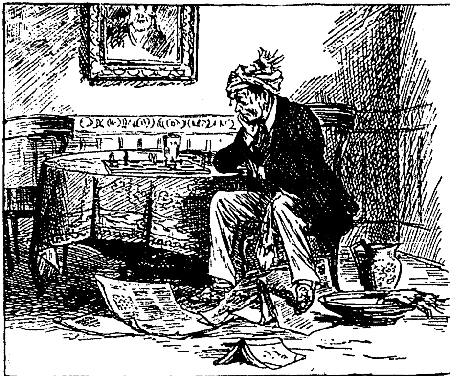
THE PROBLEM SOLVER.

THE GRAY MEDICINE CO., Toronto, Ont., Canada.